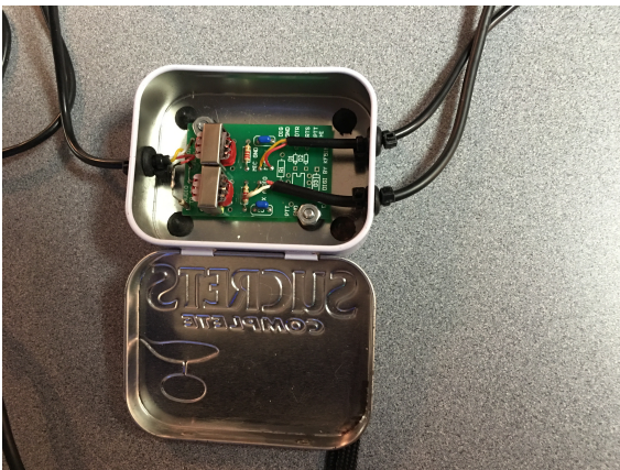
KE3ZT PC -Radio Interface