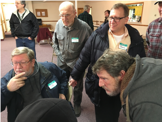
Skill Night Crowds

BCARS members and those who are regular members of the Pennsylvania traffic nets. People are just like your equipment. "Gear not tested, doesn't work!"