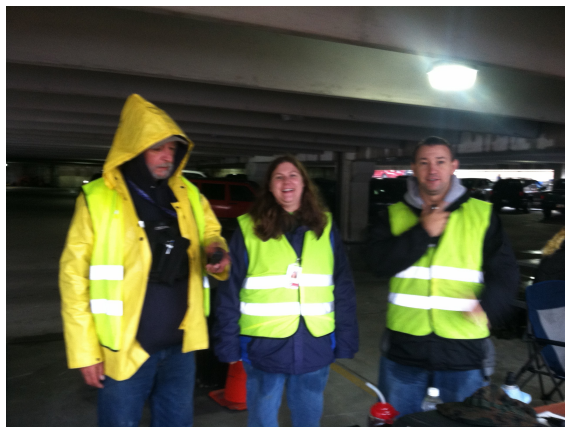
Undercover Black OPS Team in BCARS Bunker

If you haven't gotten on the BCARS email mailing list, contact KB3DFZ. Right away. It's free!