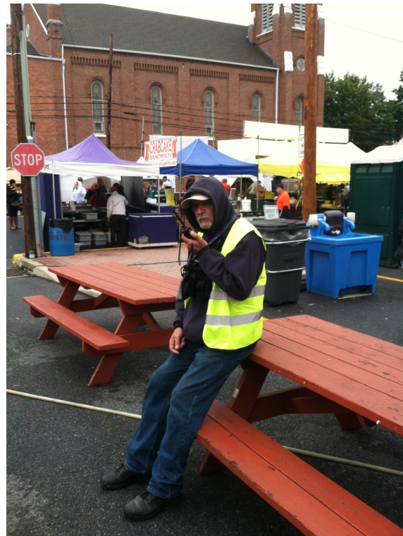
Net Control KA3UDR

KB3DFZ, AB3LP, KC3BTH, KB3HUA, KC3BTD, KB3LSH, KA3UDR, KE3ZT & WA3UXP.