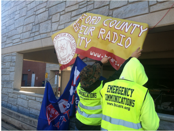
Rainy Banner Operation at Courthouse Parking Lot