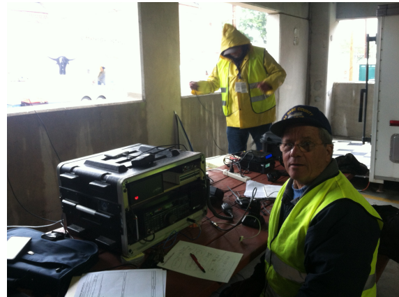
“SET” HF Station -K3NQ7

Shortly our esteemed Emergency Coordinator, (EC) KA3UDR , will be filing our SET report to the ARRL. We anticipate that BCARS will once again be in a leadership position in WPA and national SET rankings. These results will be published in a future QST.