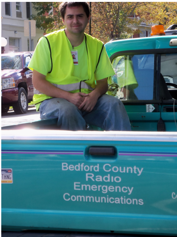
KC3CMI on duty at Fall Foliage Festival