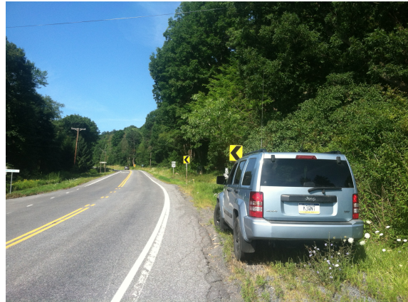
Road Guard Unit on Route 30 West @ New Baltimore Road