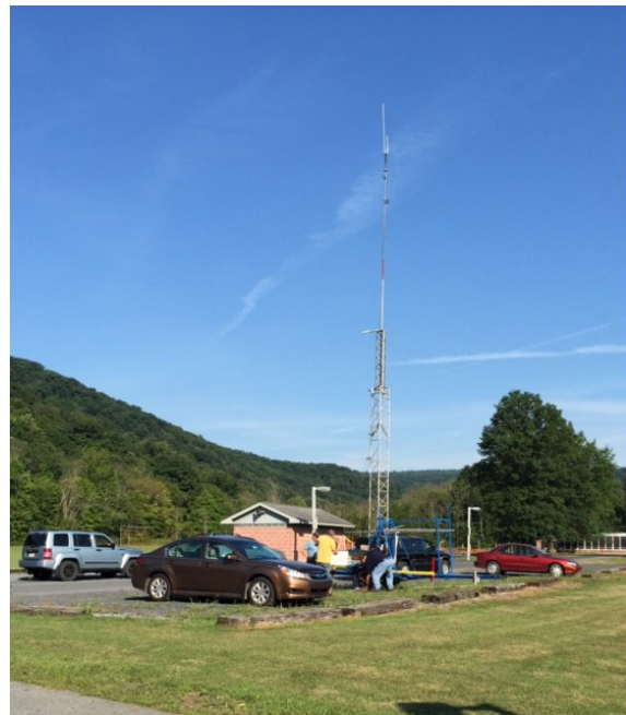
Hyndman Tower of Power