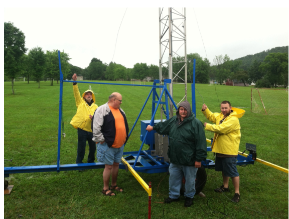
KA3UDR -KC3DNB -KC3CMF KB3DFZ

A huge team effort resulted in the erection of the BCARS tower trailer despite eight inch water at the base.