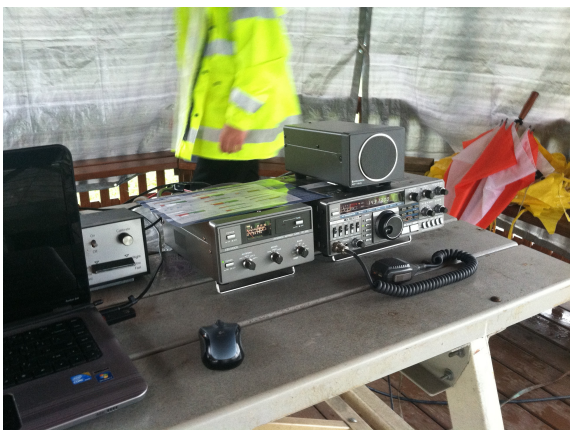
HF Set up in Gazebo at Fire Hall

Despite the poor propagation, WB3JEK and others persisted on 40 meters, 75 meters, 20 15 and even 10 meters both days.