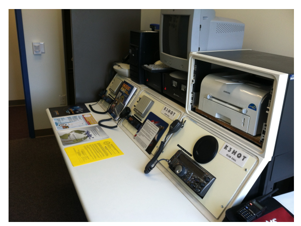
K3NQT (Key not Shown)