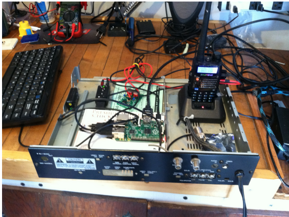
APRS Mark II Raspberry PI & Boefeng HT mounted on discarded chassis