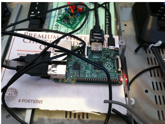
Raspberry PI Computer (Not a Duck Dessert Recipe)