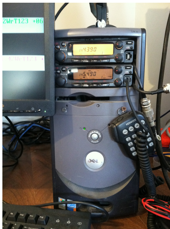
KB3DFZ HOMEBREW APRS uses two VHF transceivers and a Signal Link Interface.

Our master of all things digital, KB3DFZ has continued the ham radio spirit by building a nifty little APRS system from available kit parts and his computer junkie box. A non-ham radio eye would see a somewhat modified desktop computer, but we notice a clever re-use of a computer case with two dual-band transceivers coupled to the necessary peripherals to create an APRS system. John's desktop unit constantly monitors, maps and transmits on 144.390, the national APRS frequency.