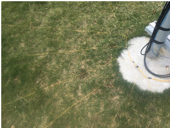
Radials At Base of Tower